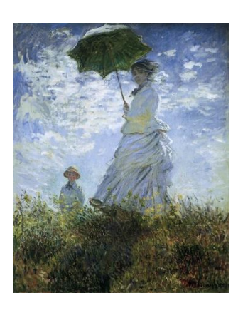
(Student 1 reference: Claude Monet, Woman with a Parasol, 1875)